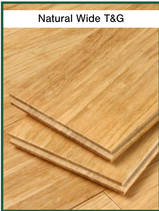
Natural Wide T&G