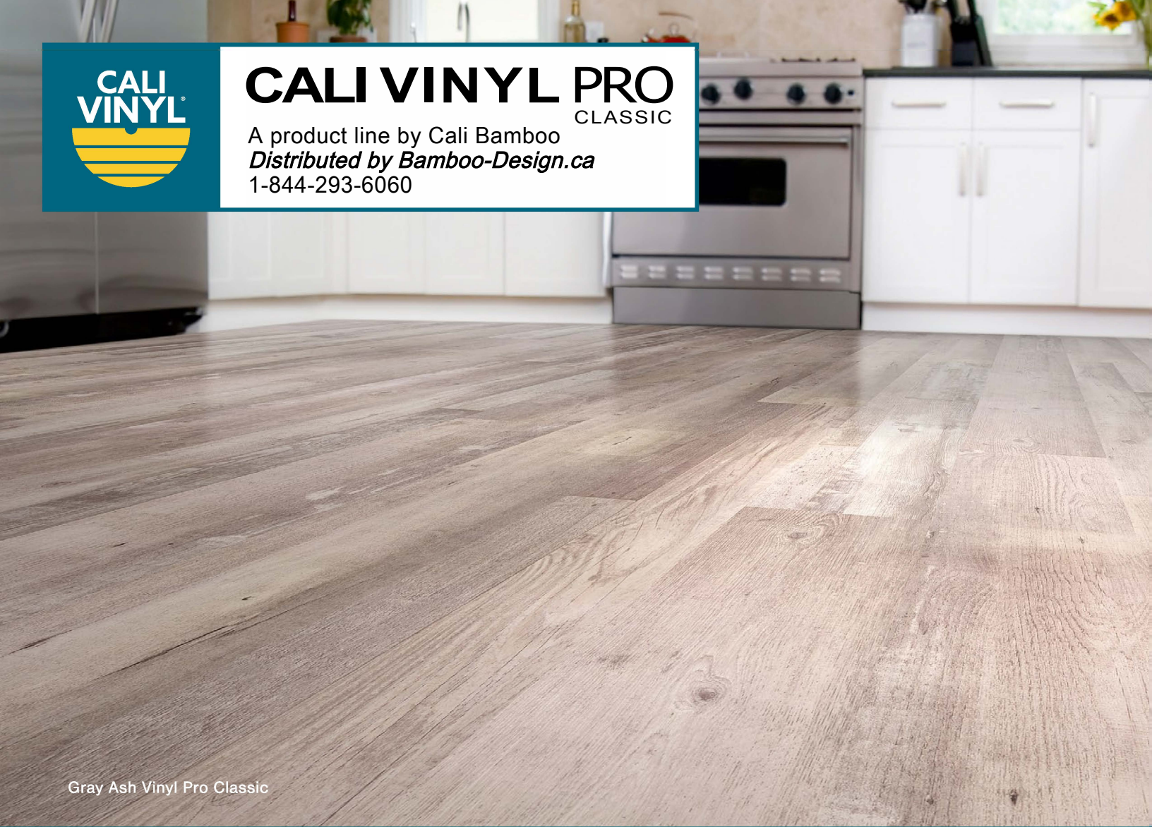
Gray Ash Vinyl Pro Classic

A product line by Cali Bamboo Distributed by Bamboo-Design.ca 1-844-293-6060