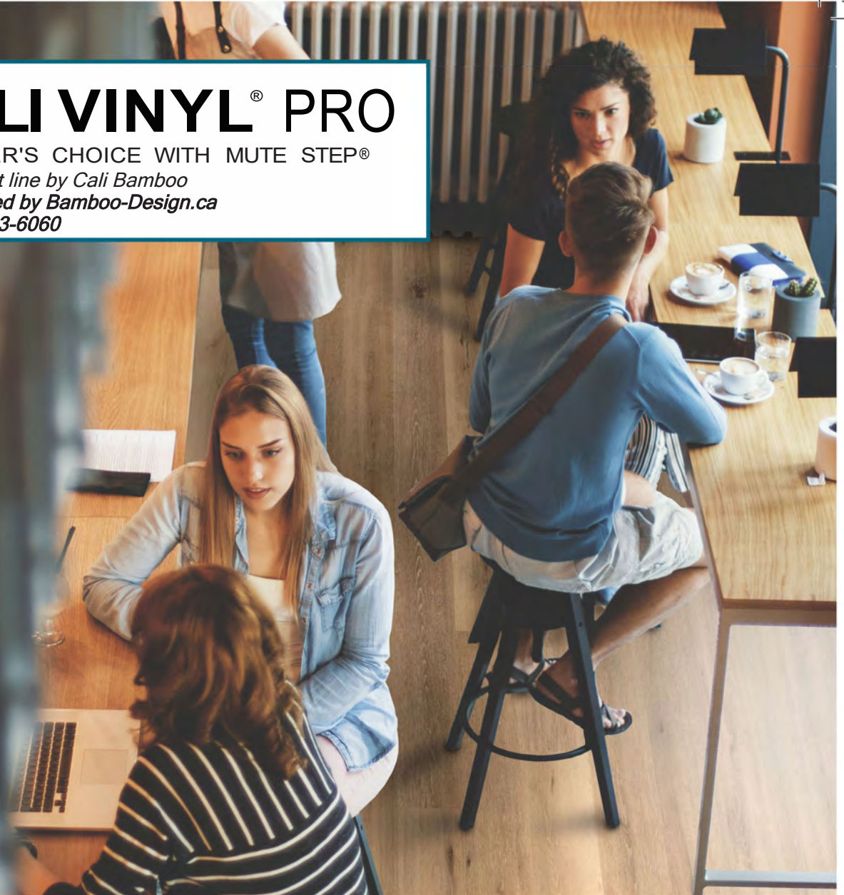
Aged Hickory Vinyl Builder's Choice

A product line by Cali Bamboo Distributed by Bamboo-Design.ca 1-844-293-6060