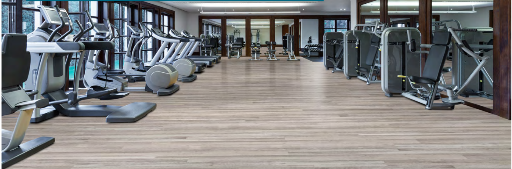
Gray Ash Vinyl Builder's Choice